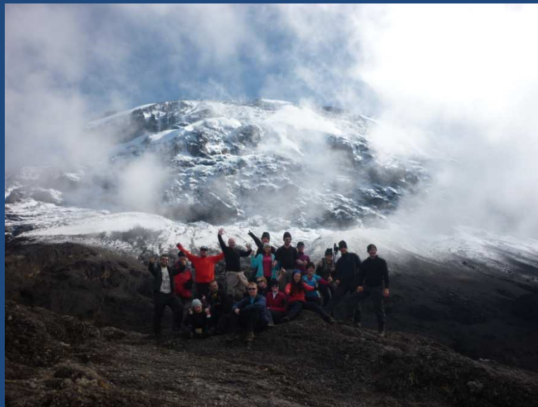
The assembled party – with summit in background

Lunch on day 4 –my dietary requirements had been heeded obviously!